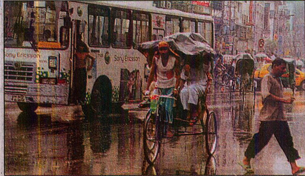
A bout of rain yesterday morning brought a brief respite to city-dwellers from an unrelenting heat wave for the last few weeks. The photo was taken in front of the National Press Club.