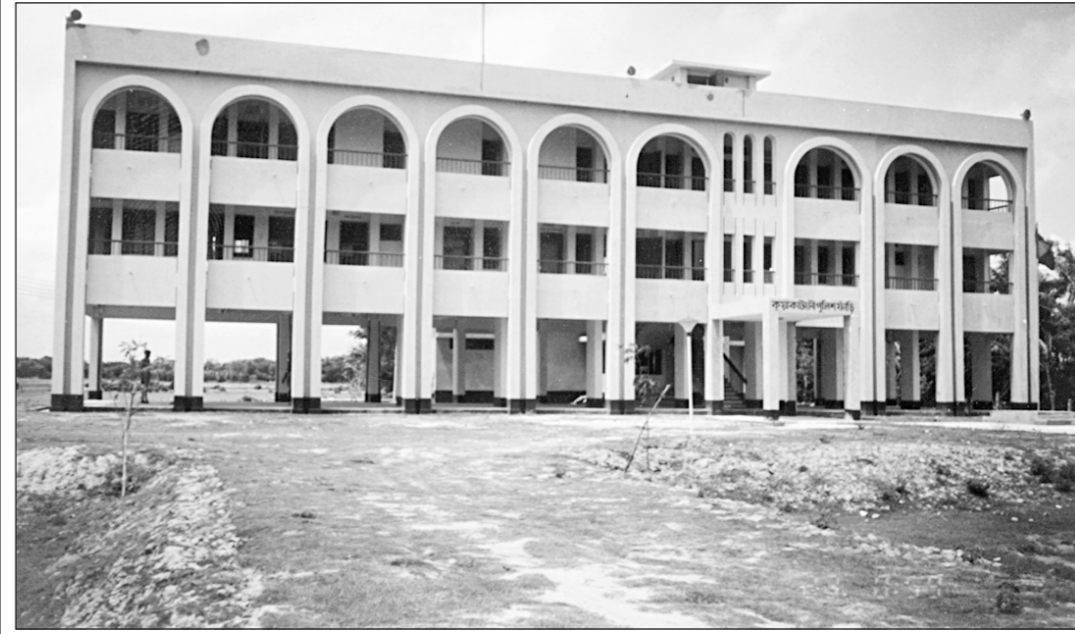
PHOTO STAR The structure is impressive and massive but not properly equipped with man and material. The Kuakata police station is of little use to the local people, tourists and fishermen in the coast. The photo was taken last week.

Nikhil Ranjan however said the police station is only a 'probe centre'. "We can only investigate cases in the area filed with Kalapara thana".