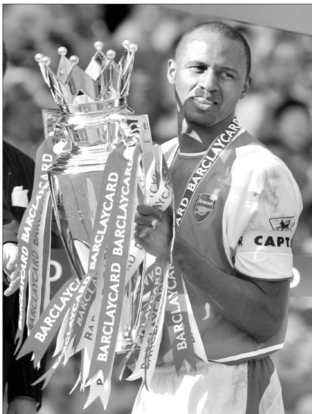
TASTY! Arsenal captain Patrick Vieira holds the English Premier League trophy after winning their final game against Leicester City on Saturday.

President Thabo Mbeki tried to extend the hand of friendship to South Africa's neighbours in the face of Morocco's disappointment in its fourth failed bid and the humiliation of Egypt, which did not gain a single vote.