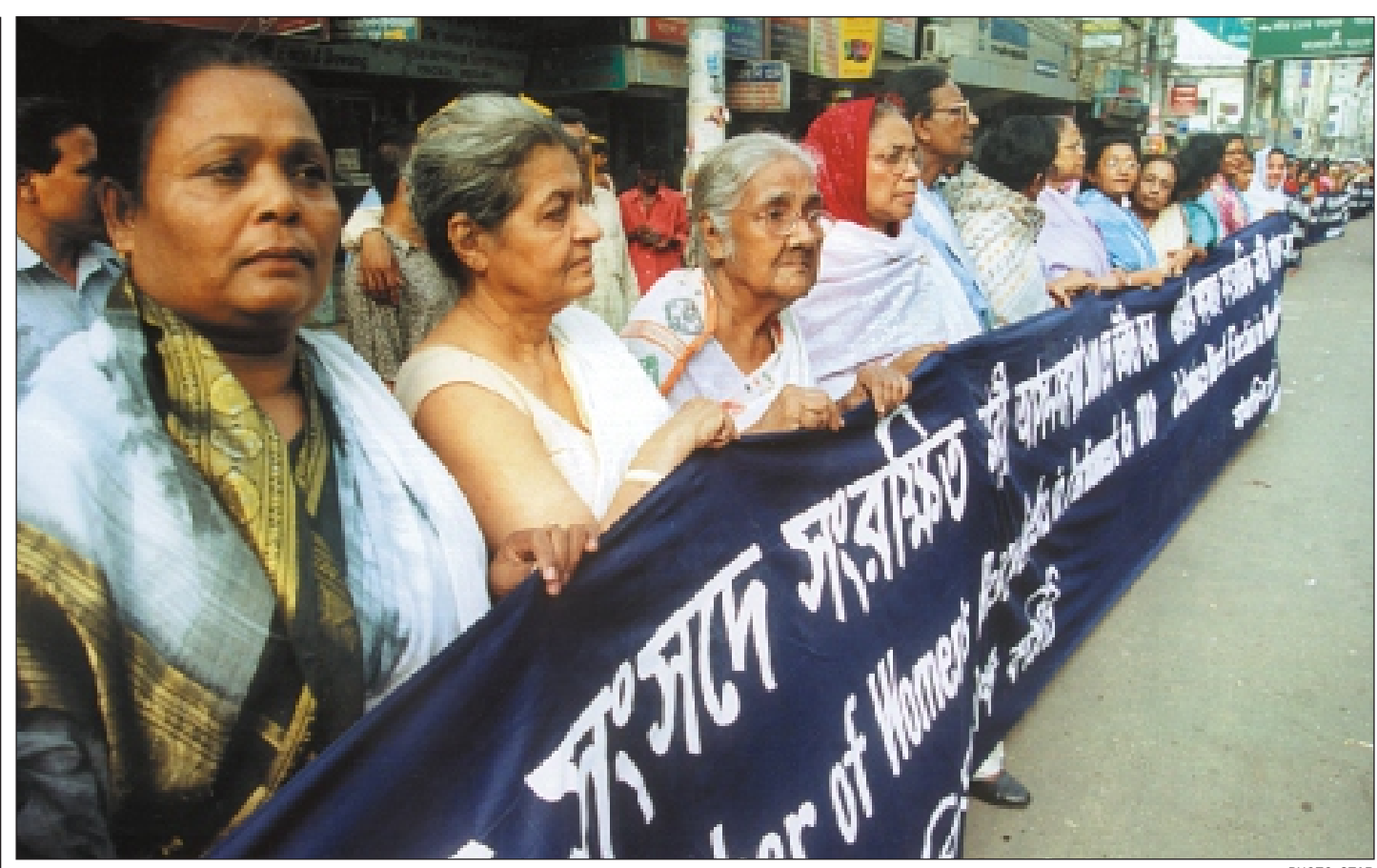
The Samajik Protirodh Committee (social resistance body) forms a human chain at the Dainik Bangla circle yesterday in support of its demand for direct elections to the reserved seats for women in parliament.

said they would hold an internal SEE PAGE 11 COL 6