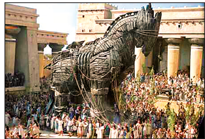
The fateful Trojan Horse in the film Troy

But the megamillion-dollar retelling of Homer's The Iliad , penned by David Benioff ( 25th Hour ), also has plenty of arrows in its quiver. Its lineup of buff leading men--Brad Pitt, Orlando Bloom and Eric Bana--has generated definite interest among under-25 females, while the massive battle sequences are a lure for under-25 men. In addition, Warners is betting that the classics-based saga also will generate interest among the two over-25 quadrants of the market.