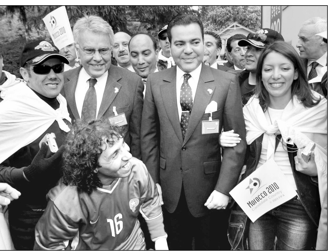
Moroccan Prince Rachid Moulay (R) and former Spanish prime minister Philippe Gonzalez (L) are greeted by Moroccan supporters at FIFA headquarters in Zurich yesterday, prior to the presentations of the five African nations bidding to host the 2010 World Cup.

Inter, who were knocked out in the quarter-finals of the UEFA Cup by Marseille, put themselves in pole position for fourth place with a 1-0 victory over Parma at the San