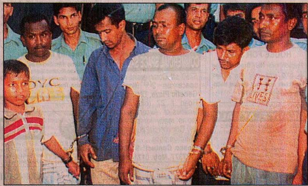
Police pick up five people, including a minor domestic help, over the killing of Awami League lawmaker Ahsanullah Master in a raid on a house in North Badda in Dhaka yesterday. The boy was supposed to be released last night.