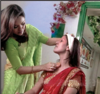
Rup Madhuri On ATN Bangla at 8:00 pm Fashion Oriented Programme