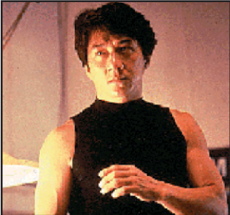
Rumble In The Bronx On HBO at 9:30 pm Genre: Action/Thriller/Comedy Jackie Chan, Anita Mui, Françoise Yip

10:25 Annodrishtee 10:30 Islamic Programme 03:40 Binodon Jummabar Shesh Akkhor 05:10 Amra Korbo Joy 08:00 Rup Madhuri 08:30 Drama Serial: Khowab 09:00 Drama Serial: Lal Neel Beguni 09:30 Drama Serial: Shapno Kapot 10:35 Kichhukkhann HBO 9:45 Innocent Moves 12:00 28 Days 2:00 Parenthood 4:30 Tales From The Crypt 15: Beauty Rest 5:15 Center Stage 7:30 Urban Legends: Final Cut 9:30 Rumble in the Bronx 11:15 Blind Side