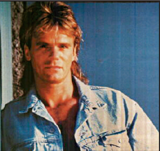
MacGyver On Star World at 1:30 pm Genre: Adventure/Drama Richard Dean Anderson, Dana Elcar

9:00 The Most Dangerous Woman Alive 11:30 Lush Life 2:00 Boys Next Door 4:30 Race the Sun 7:00 Siesta Iron Maze 11:30 Chicago