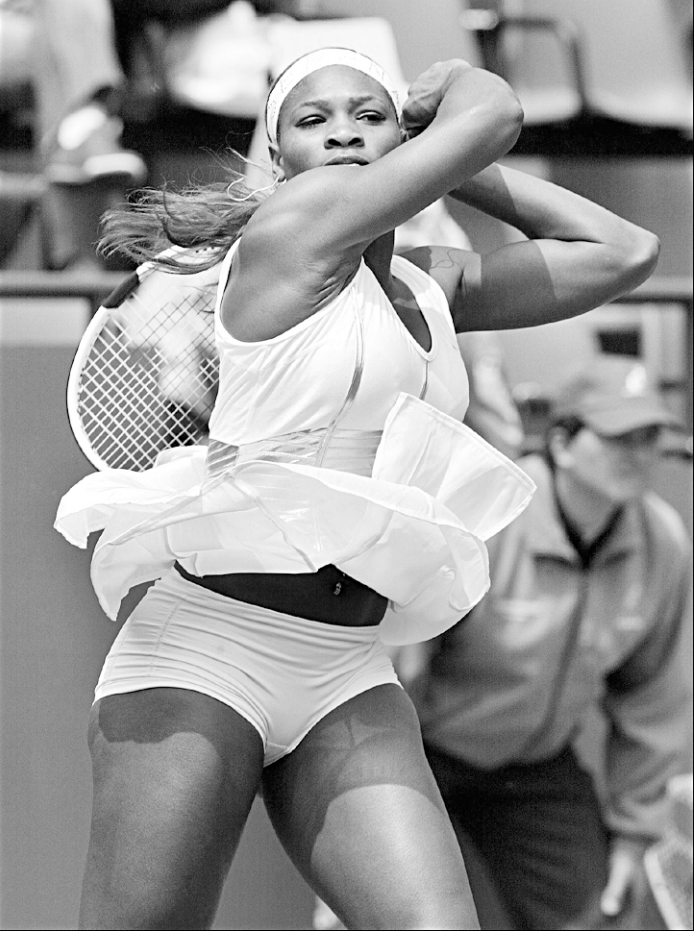
American Serena Williams in action against Spaniard Maria Sanchez-Lorenzo at the Rome Masters tennis tournament on May 11.

In the day's late match, another Italian, Flavia Pennetta delighted the home crowd by beating Laura Granville of the United States in straight sets.