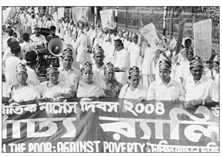
A colourful procession was brought out in the city yesterday to mark the International Nurses Day.