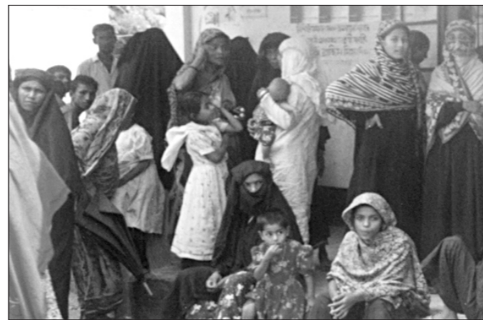
Patients crowd the health centre (left) opened by the religious affairs ministry at Ilisha Ghat and a doctor examines a patient. The photos were taken recently.

Historical places in the country will be developed to attract tourists. Facilities will be created at Madhabkunda in Moulvibazar, the lone natural water fall in the country, to attract tourists, he said.