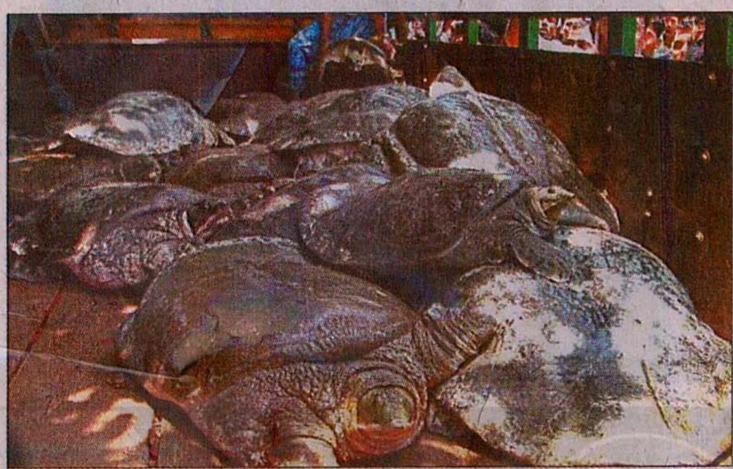
A truck carries turtles of a rare species to safety after 400 of the reptiles fell sick from poison in a pond at Hazrat Bayezed Bostami in Chittagong.