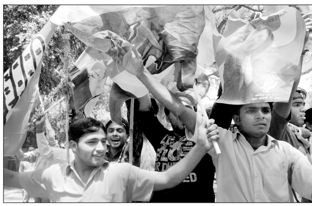
Congress Party supporters celebrate a state election win for a party ally with Party president Sonia Gandhi's poster and party flags in front of Congress Party headquarters in New Delhi yesterday. Chief Minister of Andhra Pradesh Chandrababu Naidu, a key regional ally of India's ruling Hindu nationalist coalition, conceded defeat in state elections in the southern state dealing a blow to Prime Minister Atal Behari Vajpayee's efforts to form a government.

"This party's government would strive to resolve the issue in co-operation with its ally Telangana Rashtra Samithi (TRS). On the other hand BJP yesterday termed the Congress-TRS sweep in Andhra Pradesh as 'unexpected' even if it ruled out any review of its ties with the TDP.