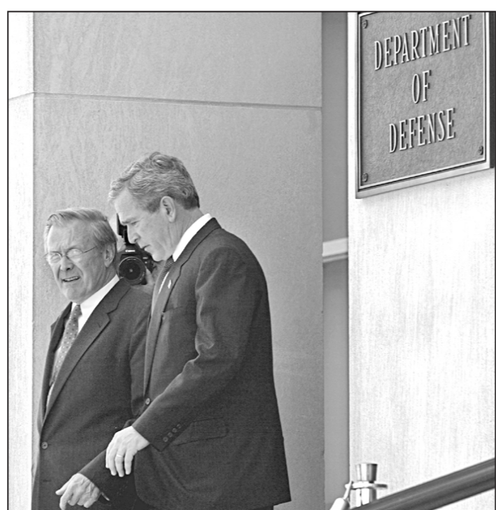
President George W. Bush (R) and US Secretary of Defense Donald Rumsfeld (L) emerge from the Pentagon on Monday after meeting privately with top US military leaders. At an hour long briefing attended by top cabinet officials and Rumsfeld, Bush was shown a representative sample of the hundreds of photographs of abuses of Iraqi prisoners by US soldiers that have not yet been seen by the US public.

AMA is conducting the quick count for "Eleksyon 2004," the coverage of the local and national elections by GMA-7, Philippine Daily Inquirer, Inq7.net, PLDT, Smart, Catholic Media Network, the Philippine Center for Investigative Journalism, dzBB and New Media Inc.