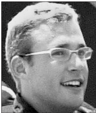
Daniel Vettori (New Zealand spinner) "AIDS is a disease that can affect any type of person in any country."