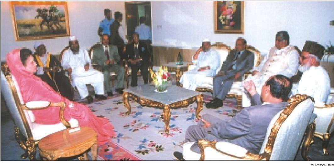
Prime Minister and BNP Chairperson Khaleda Zia holds a meeting with the top leaders of the ruling four-party alliance at her office yesterday.