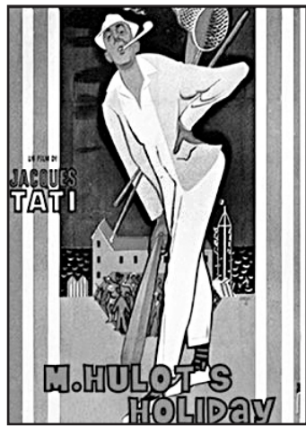
Mr Hulot's Holiday (1953)

Jacques Tatischeff, of Russian-Dutch-Italian-French descent, was born on October 9, 1908. His birthplace was Le Pecq in France. Though