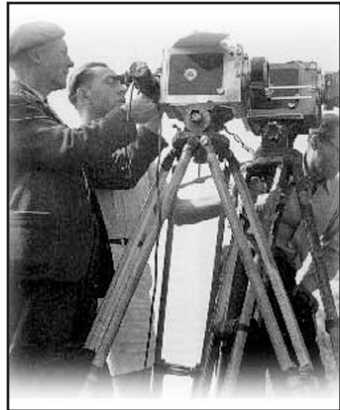
Jacques Tati, centre, looking through the camera

JACQUES Tati is considered as the French Buster Keaton or Charlie Chaplin. He is the best French comic actor since Max Linder. As an actor and an auteur filmmaker, Tati has shown immense talent in portraying characters down to their essential comic details. The prolonged production of his films can be compared to those famous for multiple and meticulous takes of a single shot, like his compatriot Robert Bresson or Italian Michelangelo Antonioni. This