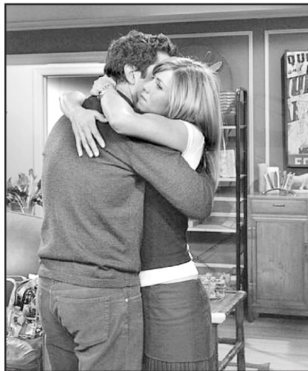
A scene from the last ever episode of Friends

Of more than 30,000 people to respond to an America Online poll, 77 percent said rekindling Ross and Rachel's romance was the perfect ending for the show.