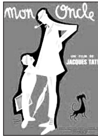
My Uncle (1958)

Les Vacances de Monsieur Hulot (Mr Hulot's Holiday, 1953) followed. The film saw the creation of a new comic hero Mr Hulot, who is