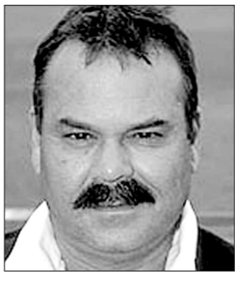
DAV WHATMORE And they endured an 18-match losing sequence in ODIs before beating Zimbabwe by eight runs in March.

Cricket BBC ONLINE, undated Bangladesh coach Dav Whatmore said there was no reason his side could not be "very competitive" as the squad arrived for a tour of the Caribbean on Saturday. He said: "We understand that every team we play against is a big challenge." "At the same time, we have an opportunity, as young as the players are, to give their best performances." Bangladesh play a one-day warm-up match in St. Vincent on Wednesday, then have three one-day internationals, a three-day tour match and two Tests. Whatmore repeated a mantra that has become a familiar refrain since he started the job 10 months ago. "If we fight every session, every day in the longer game, whether we win or lose is to me immaterial," he said. "What counts for me is that we give a good account of ourselves." "In order for us to do well, we need even contributions, from as