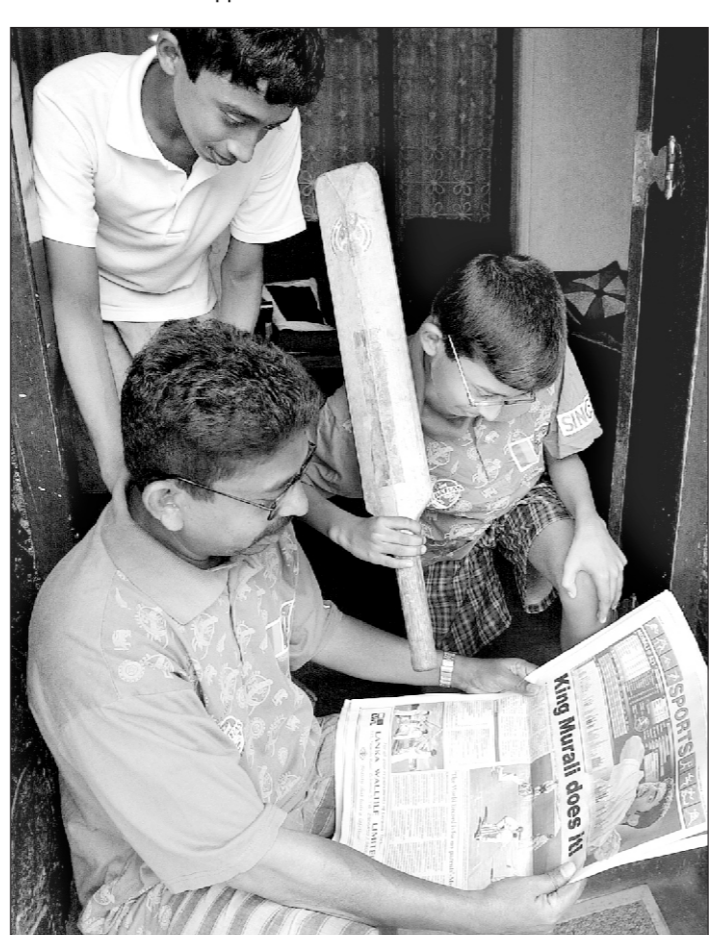
A Sri Lankan man and his two sons read reports on Muttiah Muralitharan's breaking the world record in a newspaper in Colombo yesterday.