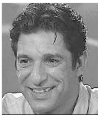
WASIM AKRAM injuries to Pakistani players during the third Test which Pakistan lost by an innings and along with it the series 2-1.

Cricket AFP/REUTERS, undated Former Pakistan cricket captain Wasim Akram on Sunday described an inquiry into the injury sustained by pace bowler Shoaib Akhtar in last month's deciding Test against India as a "big mishap". Akram's comments follow a warning issued to Akhtar by the Pakistan Cricket Board (PCB) on Saturday telling him to improve his conduct while playing for the national team. "The medical inquiry was a big mishap. We should have avoided it. (It was carried out) simply because India was a better team and they beat Pakistan," Akram told AFP. Doubts had been raised over an injury Akhtar claimed during the decisive third and final Test against India in Rawalpindi after he hurt his wrist and back in a fall on his follow through on the second day. The 28-year-old Akhtar did not take the field on the third day, but his coming out to bat seemingly unaffected on the fourth day raised suspicions over the extent of his injury. He and three other Pakistani players appeared before a four-member medical commission formed by PCB to assess a spate of and 352 one-day games for Pakistan, said: "I think the captain, coach and the manager should handle a player and it should not happen like this. How can you assess an injury after two weeks." "Nobody knows where the medical commission's report is and what the aim of the inquiry was." Akhtar who left for England on Sunday to play for Durham county