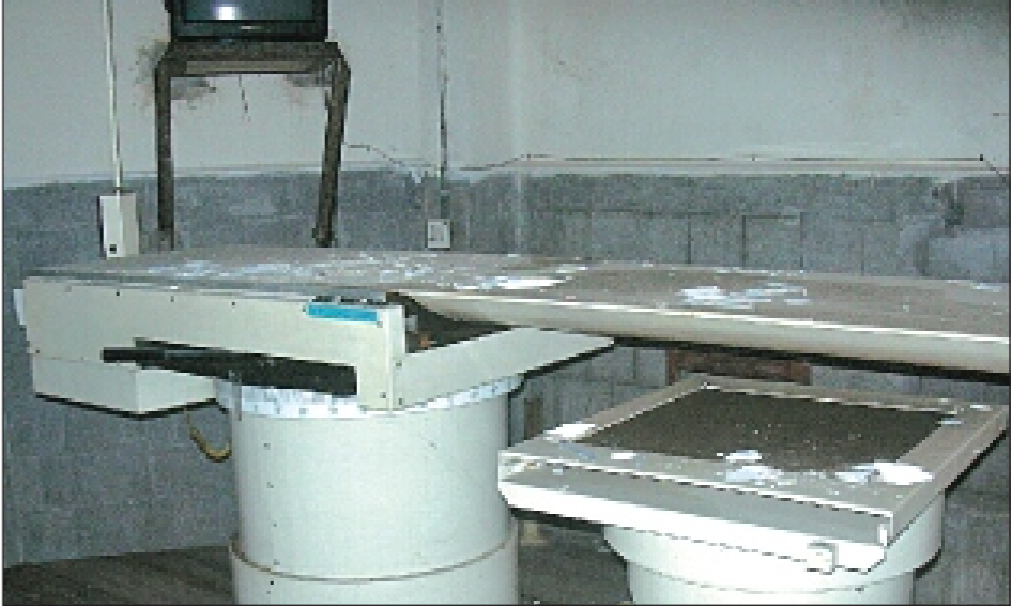
A Tk 3.2 crore simulator machine at Dhaka Medical College Hospital radiotherapy department lies unused while cancer patients suffer for lack of proper treatment.

NAIMUL HAQ Three pieces of expensive medical equipment for cancer treatment worth over Tk 5.6 crore are gathering dust for more than five years at Dhaka Medical College Hospital (DMCH). For reasons unknown, these precision instruments, considered vital for accurately locating and treating cancerous tissues, were never used since their installation and have been left uncared for in pathetic conditions at the country's premier public hospital. Official sources said at least 2,500 patients, who could have been partially or completely cured with the help of these instruments, are denied treatment every month due to non-availability of these machines. The Tk 3 crore radiotherapy simulator and the Tk 2 crore brachytherapy machine (called Cobalt 60 after loading brachytherapy) used worldwide to treat cancer in advanced stage were delivered to the hospital in June 1998. Abdul Aziz, chief executive of Mardel Agencies that supplied the two Chinese machines, said the company could produce papers certifying that the DMCH authorities received the machines in good working conditions. Doctors and technicians at the hospital also said the machines had been put through test runs before being handed over. These two machines along with a German-made computer planner SEE PAGE 11 COL 4