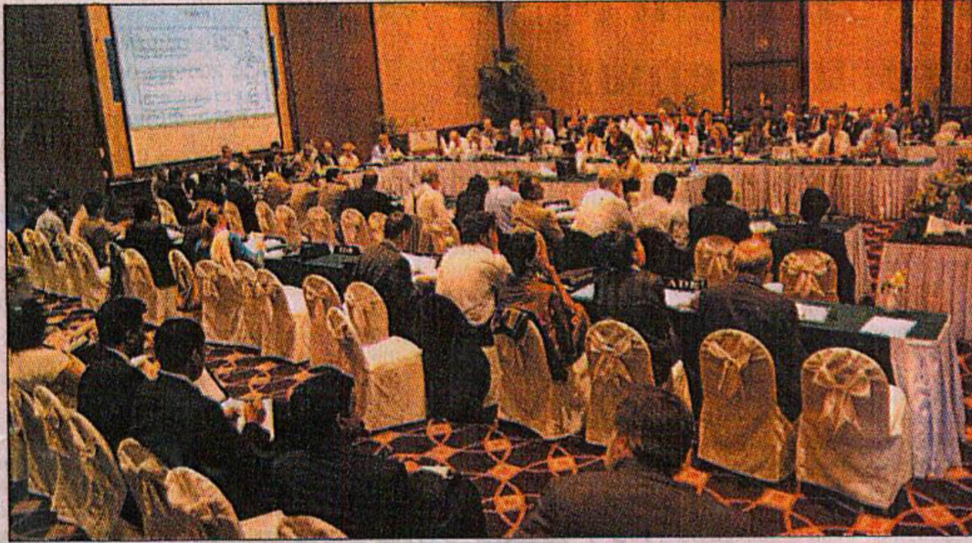
The Bangladesh Development Forum meeting in progress yesterday, the second day of the three-day annual meet, at Hotel Sonargaon.