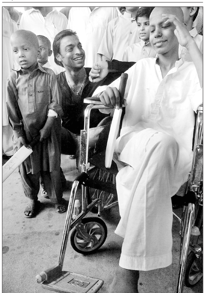
Pakistan fast bowler Shoab Akhtar (2nd from L) spends some time with children undergoing cancer treatment during his visit to a hospital in Lahore yesterday.