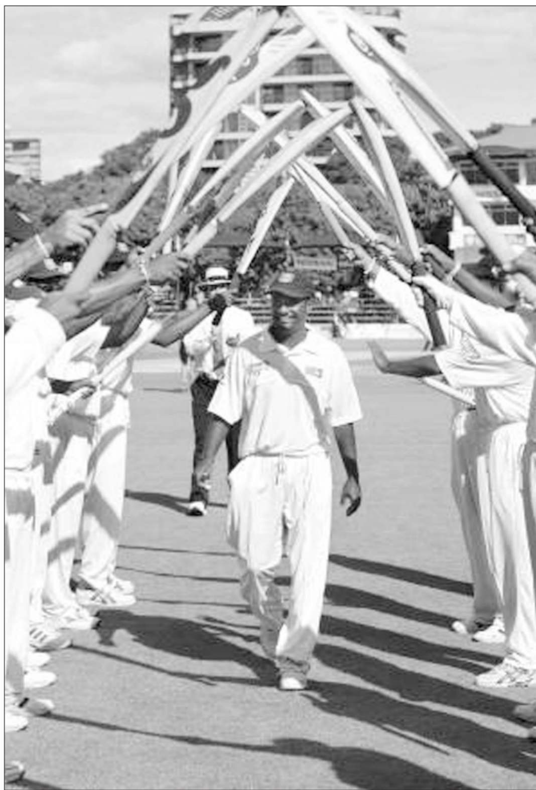
ARCH FOR ACE: Sri Lanka bowler Muttiah Muralitharan leaves the field through an archway of cricket bats, held by his teammates, after his world record-breaking performance at Harare yesterday.