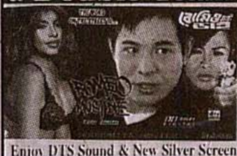
Enjoy DTS Sound & New Silver Screen