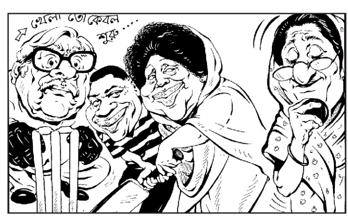
A sample of one of Shishir's latest cartoons

SB: I have no conventional studio and work in a separate space