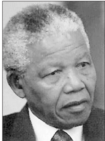
Nelson Mandela (Former South African president) "Where is Brian Lara?" The first question posed by him after his arrival in Trinidad.