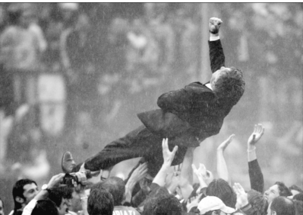
HAIL THE ARCHITECT: AC Milan coach Carlo Ancelotti is lifted by his ecstatic players at the end of their match against AS Roma at Milan's San Siro Stadium on May 2.