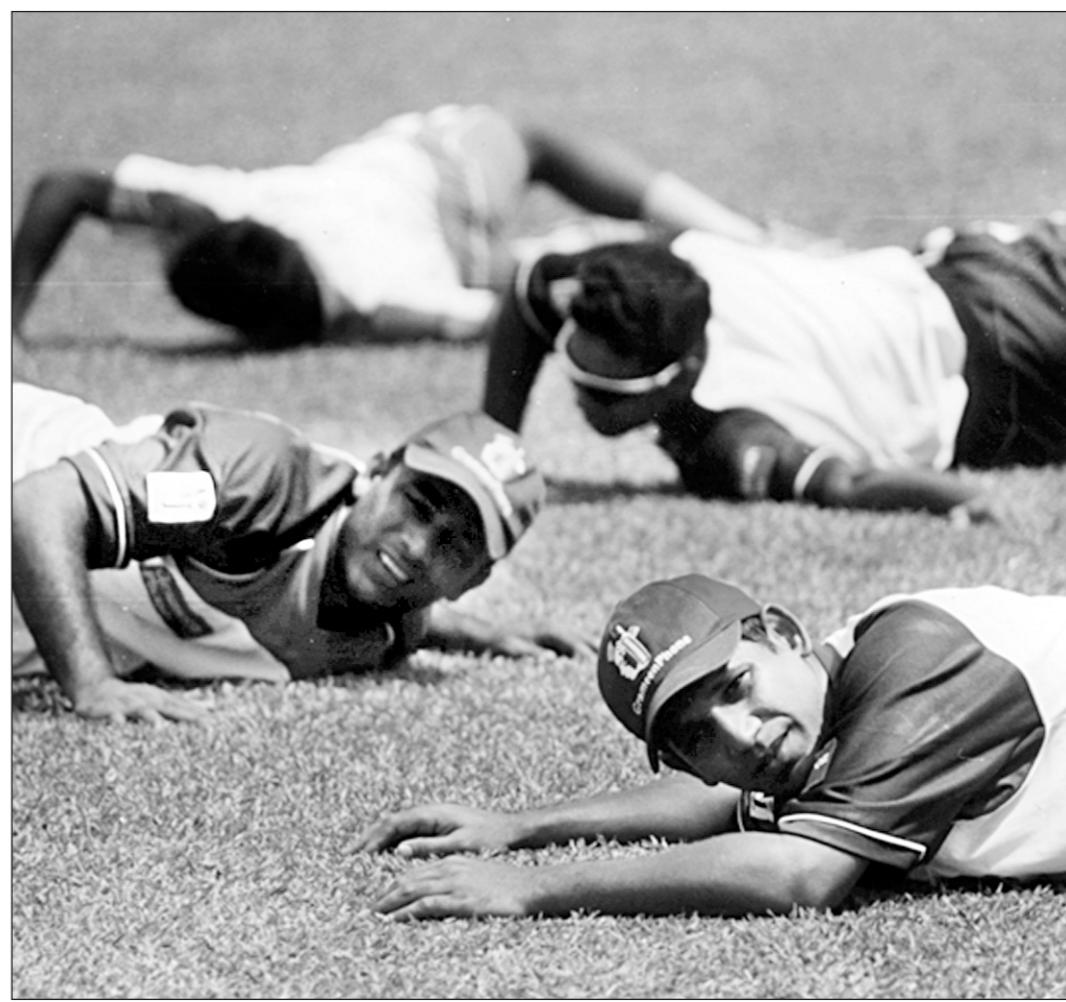
PREPARING FOR THE CARIBBEAN WAVES! Bangladesh captain Habibul Bashar (R) and opener Shahriar Hossain (L) going through a ground stretching routine during the Tigers' practice at the Bangabandhu National Stadium yesterday.