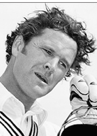
Chris Cairns (New Zealand all-rounder) "Sometimes I feel England fall victim to their own institutions."