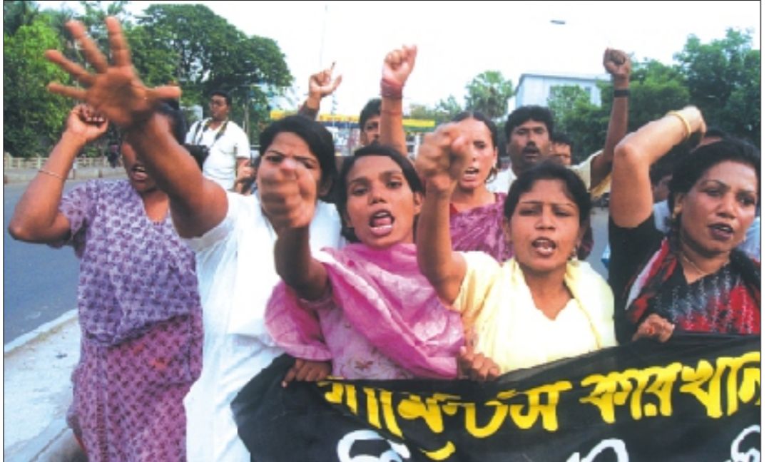
Bangladesh Garments Sramik Oikya Parishad took out a procession in the city yesterday demanding compensation for the stampede victims. Six women garments workers were killed in a stampede at a garments factory at Mirpur.