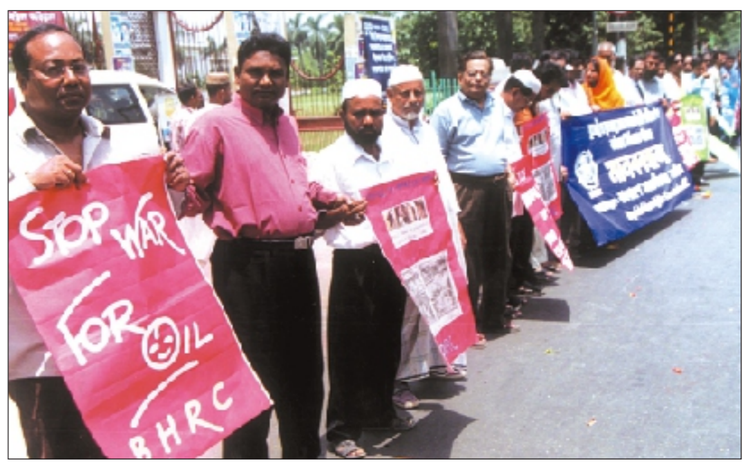
Bangladesh Human Rights Commission forms a human chain in front of the High Court yesterday protesting sadistic and blatant criminal abuses of prisoners by the US soldiers in Iraq.