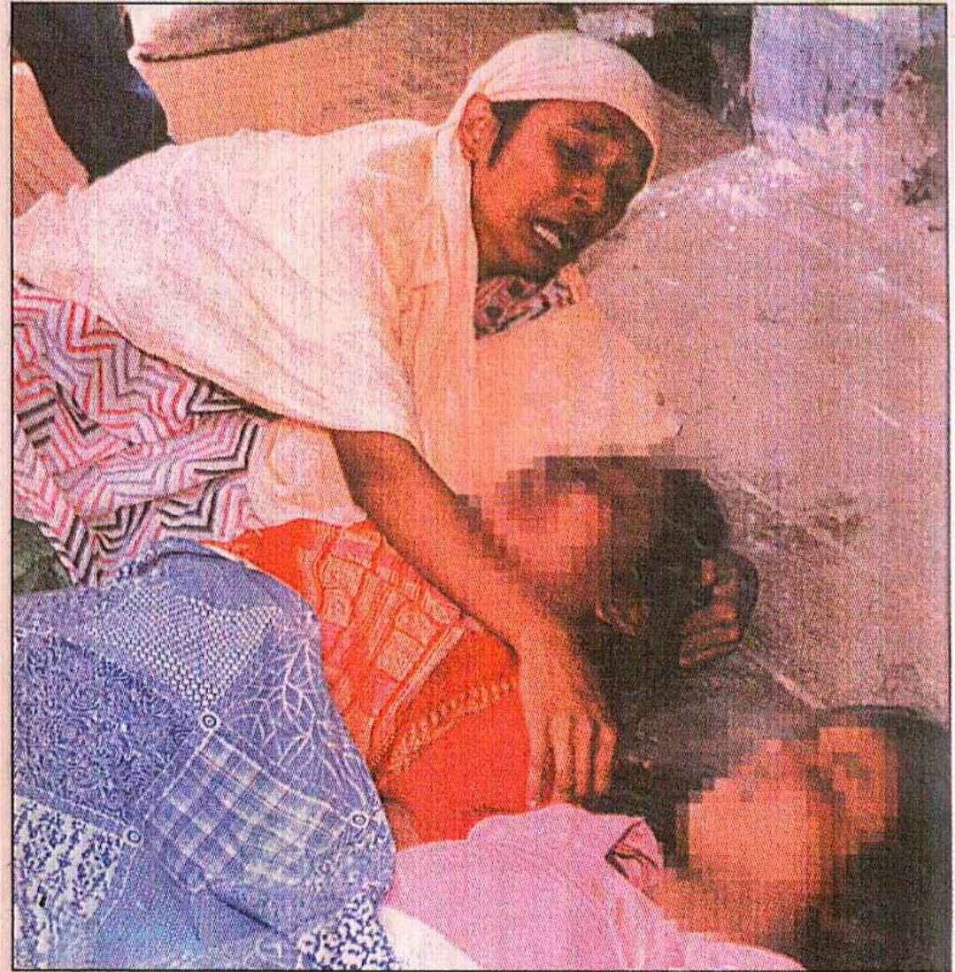
A woman mourns over the bodies of two female garment workers killed yesterday in a stampede triggered by a fire in a Mirpur building housing garment factories.