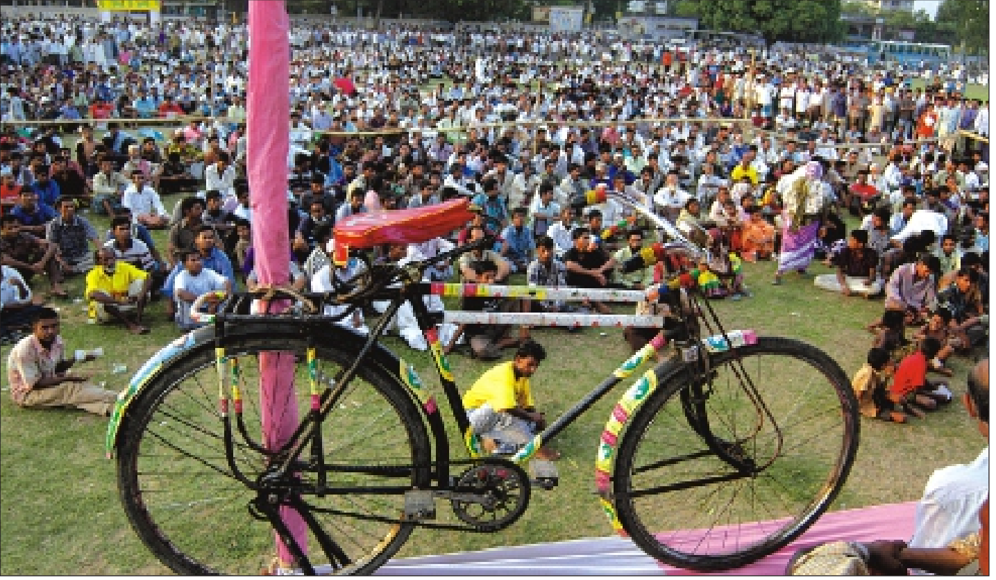
A bicycle, the election symbol of a chairman candidate, is fastened to the corner of a stage during an election rally yesterday in the run-up to the May 5 Gazipur municipal polls.

Odhikar, another NGO, will also monitor the election at 13 out of 117 municipalities. The Odhikar team will reach the election areas on May 4. It will monitor especially the incidents relating to human rights