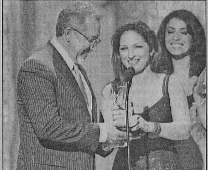
Singer Gloria Estefan (C) and husband Emilio accept the award for Latin Pop Airplay Track of the Year in the Female category for Hoy during the 2004 Billboard Latin Music Awards at the Miami Arena on April 29 in Miami, Florida.