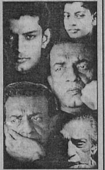
Feluda has always been favourite among the Bangladeshi of all ages. In 1992 Ray was given an honorary Academy Award. He died on 23 April 1992.

Ray also edited Sandesh , a children's magazine, and wrote numerous fictions and essays works. His detective character