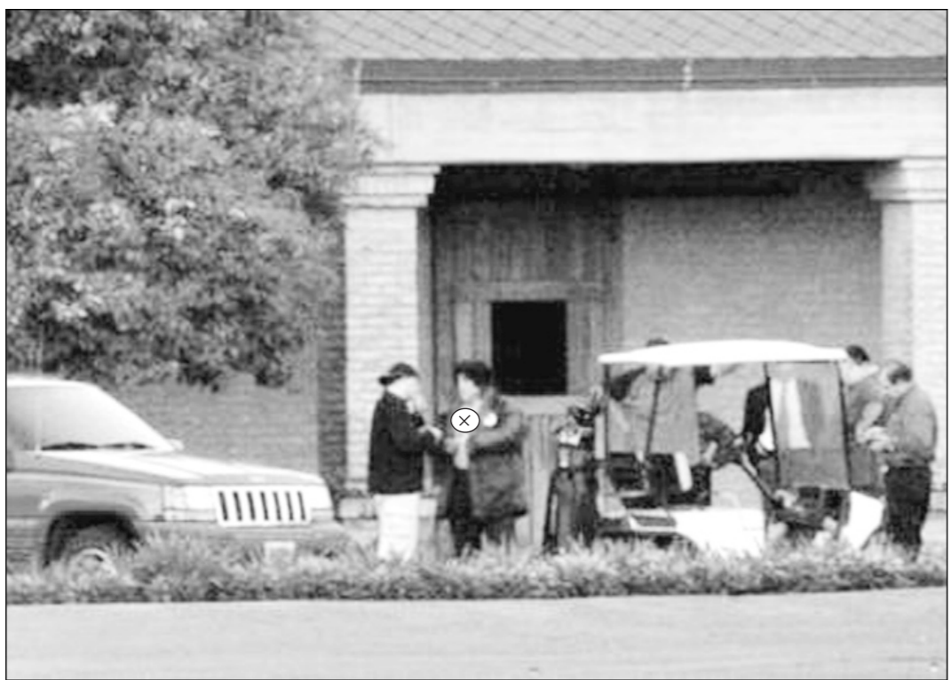
LOOKING GOOD! Argentine legend Diego Maradona (X) talks to a friend at a country house in General Rodriguez, on the outskirts of Buenos Aires on April 29. Maradona left the hospital after being in intensive care for 12 days.

The last medical report Wednesday said his condition was stable with progressive improvement of the cardio-pulmonary system and that he no longer had a fever and the only medication he was taking were antibiotics.