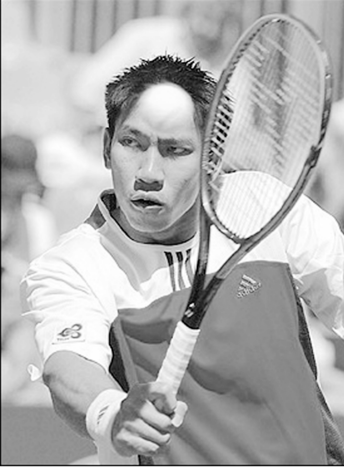
Thailand's Paradorn Srichapan slices backhand against Belgium's Olivier Rochus at the BMW Open in Munich on April 27.

The fiery Croat thumped his racket off the ground and let out some trademark outbursts as his shots continued to find the middle of the net.