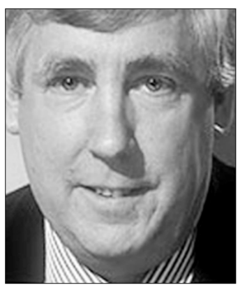
DES WILSON "In the short term, I believe the ECB should make such a tour only under protest.

international tours programme with draconian and disproportionate penalties that would devastate the English game, forcing the ECB itself into insolvency and bankrupting up to a third of the first-class counties.