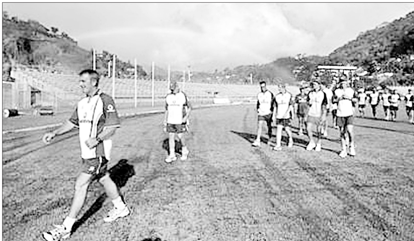
RAINBOW IN THE DARK! England cricketers leave the field after a quick check of the pitch at the Queen's Park ground at St. George's in Grenada on Tuesday.

Although Futsal is yet to make its debut in the country, Bangladesh has already featured in an international competition in Qatar early this year.