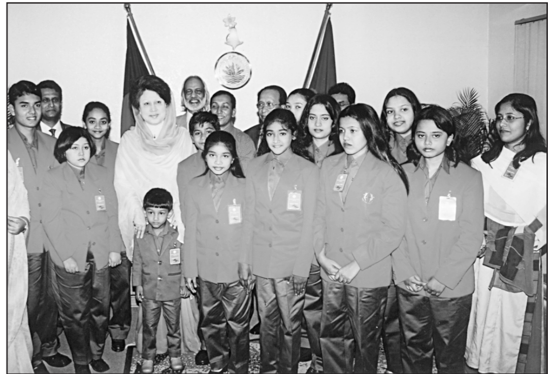
A 15-member children's delegation of Zia Shishu Academy made a courtesy call on Prime Minister Khaleda Zia at her office yesterday.