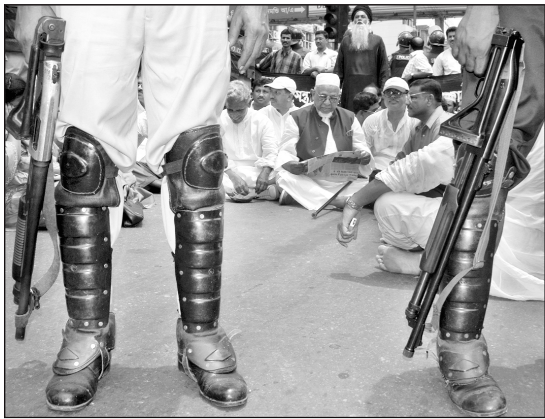
Police stand guard as Awami League leaders stage a sit-in on a road at Dhanmondi Russell Square in the city on the first day of hartal yesterday.