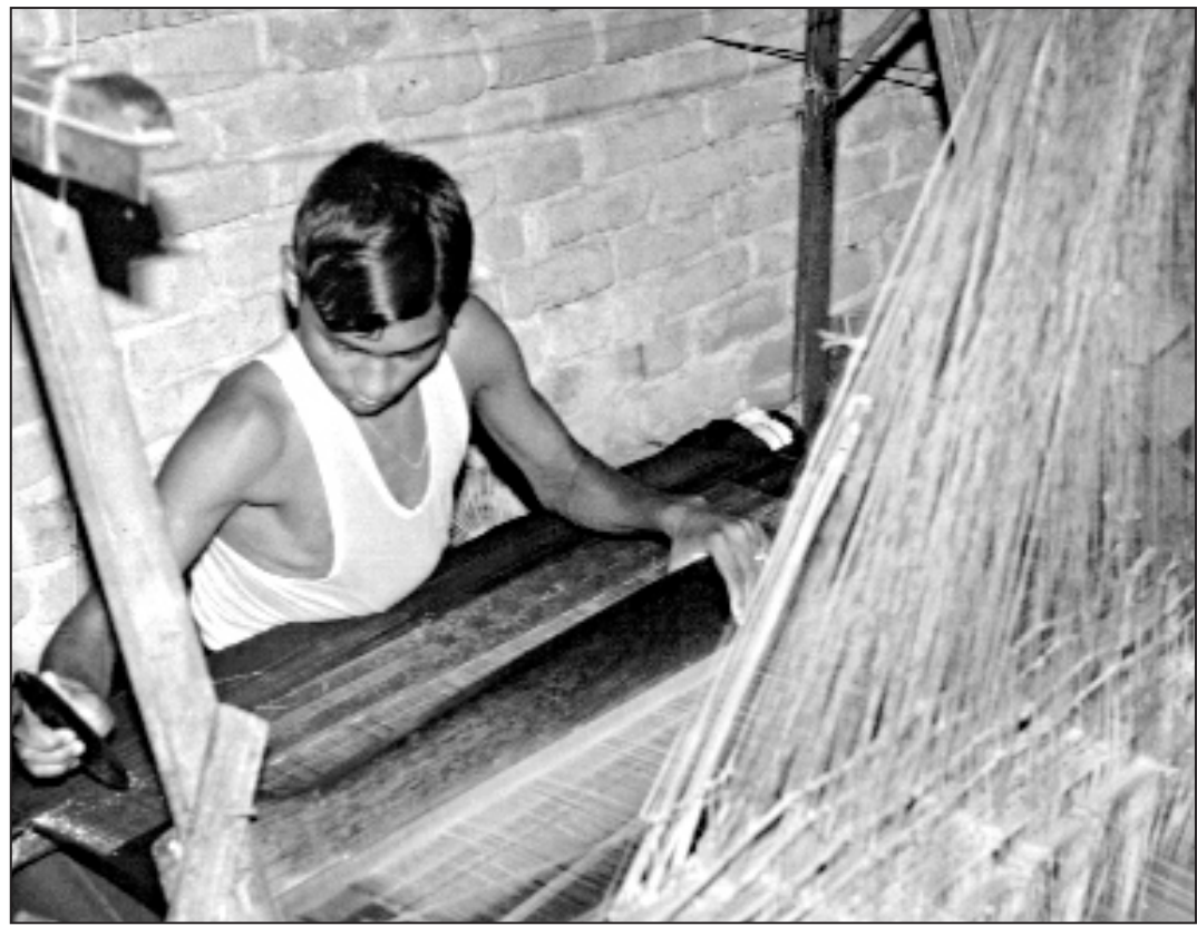
A teenager producing Benarasi Sari at Char Habu village.

as a worker at a Benaroshi factory in Mirpur in Dhaka fifteen years back. He also went to Iran and Pakistan to learn better weaving and knitting. He returned to his native Char Habu village in 1998 and set up three handlooms to produce Benaroshi. He set up four more in two years and encouraged others to set up handlooms at their houses. He also trained fellow villagers.