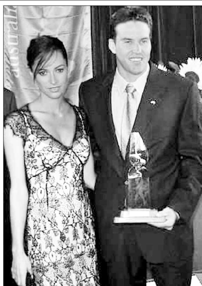
A file photo of former Australian tennis star Patrick Rafter and his girlfriend model Lara Feltham who tied the knot in a private ceremony in Fiji on Saturday.

"The AFC has stopped paying for foreign coaches at national level as it is trying to develop the game in underdeveloped countries from the grassroots. It is also encouraging local coaches to do the job," the BFF general secretary added.