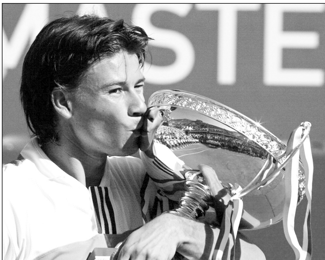
CLAY MASTER: Argentine Guillermo Coria kisses the trophy after the Monte Carlo final on Sunday.

"I just lay down and watched it trickle out for about five minutes or so."