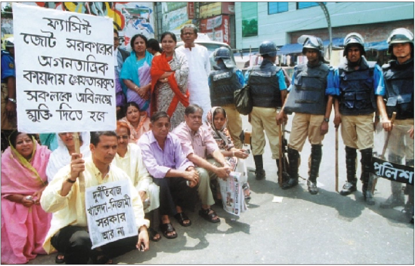
Awami League leaders, hemmed in by policemen, sit on the kerb at Zero Point yesterday on the third and final day of their "mass no-confidence" programme in the run-up to the party's April 30 deadline for unseating the government.

opposition bid to unseat the BNP-led alliance government by April 30. Such arrests go against the spirit of the constitution that guarantees human rights of all citizens. They do not also support any unconstitutional change of government, he added. Urging the feuding political leaders to take time to "cool off", the FBCCI said, "The cool-off period will be six months and we appeal to all groups and professionals to back us for the sake of national interest. We urge the opposition parties not to call hartal and the government not to crack down on activists of opposition parties to pave the way for dialogue for reconciliation." The FBCCI proposals recommended that political parties will not support any siege of land and sea ports, highways, rail lines and