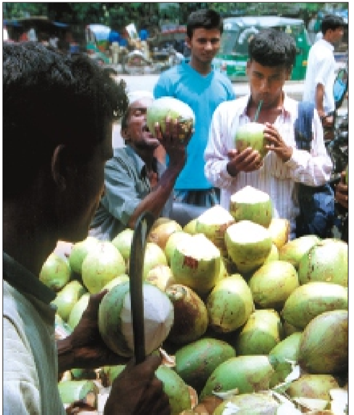
Coconuts are in demand now as the summer heat has intensified. Selling at Tk 8 a piece, coconuts are also a solution to spurious bottled water.

Finance Minister M Saifur Rahman yesterday said the World Bank and International Monetary Fund (IMF) were 'satisfied' with Bangladesh's economic performance, but were 'unhappy' about its progress in administrative reforms, governance and curbing corruption. "They have reservations about a few non-economic factors in Bangladesh," Saifur said yesterday at a press briefing on his weeklong visit to the WB and IMF headquarters in the US. "The donors have asked us to take strong steps to improve governance and administration and curb corruption and address other issues," he added. "We have told them we will form an anti-corruption commission. The recruitment process for consultants for the Agrani Bank and other nationalised commercial banks is in the advanced stage. We are going to form a regulatory commission for