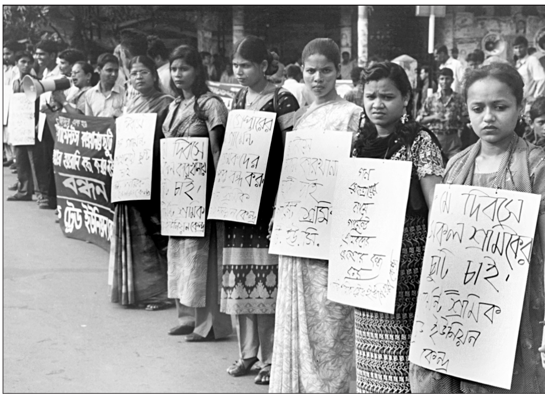
Garments Sramik Trade Union Kendra forms a human chain at Muktangan in the city yesterday demanding holiday on May 1.