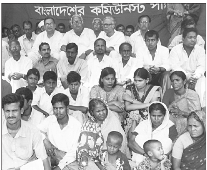
Communist Party of Bangladesh (CPB) observes a token hunger strike in front of its office in the city yesterday to protest against mass arrests and killings and crimes.