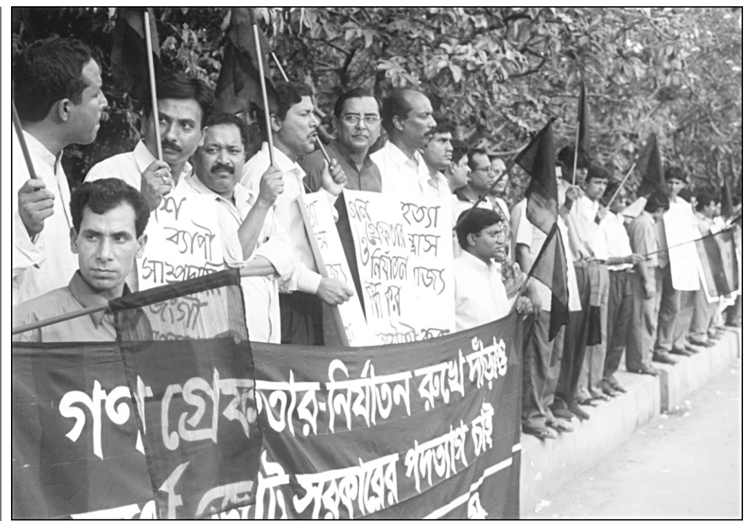
Bangladesh Jubo Maitry forms a human chain at Muktangan in the city yesterday demanding resignation of the government and protesting mass arrest across the country.

Earlier, the event was scheduled for April 30 but the date has been changed due to unavoidable circumstances.