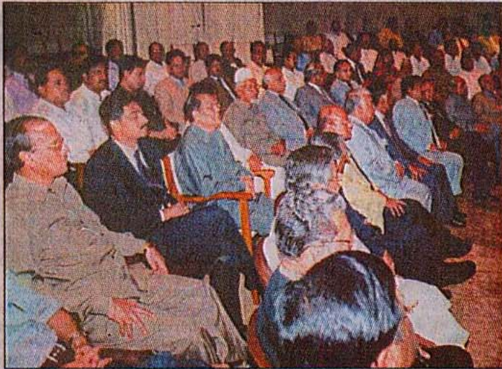
Prime Minister Khaleda Zia presides over a meeting of the BNP (Bangladesh Nationalist Party) Parliamentary Party at Jatiya Sangsad Bhavan yesterday.