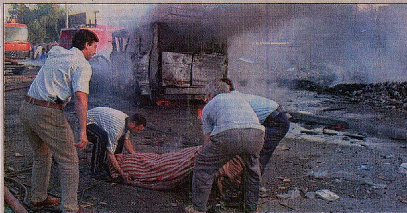
People remove a dead body from the site of an explosion in the southern Iraqi city of Basra yesterday. Sixty-eight people were killed in almost simultaneous attacks on three police stations.