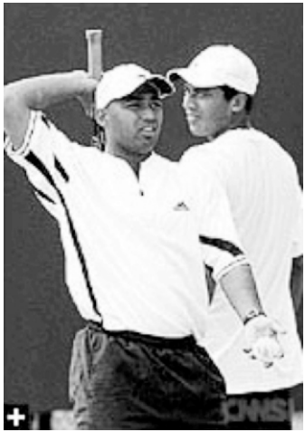
Leander Paes and Mahesh Bhupathi

They lost to the Australian pair of Todd Woodbridge and Mark Woodforde in the second round on both occasions.