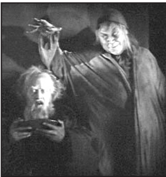
Ascene from the film Faust

Goethe Institut, in cooperation with the Zahir Raihan Film Society (ZRFS), is bringing to the city six silent movies of the post-First World War period from 1918 to 1925. The