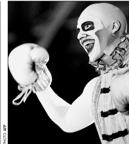
Performer Boom Boom from the critically acclaimed Cirque du Soleil performs for guests at a special preview of the upcoming production of Quidam in Sydney on April 15. Quidam , a latin word for 'an anonymous passer-by', is Cirque du Soleil's thrilling combination of acrobatic artistry, extravagant design and exceptional musical inspiration by 50 performers from 10 countries.

On invitation of the ITI Bangladesh and Cultural Identity and Development, an international committee of ITI, 15 participants worked for 10 days in this workshop that started with Samuel Beckett's Waiting for Godot . A few scenes from the drama will be presented at the documentation show.