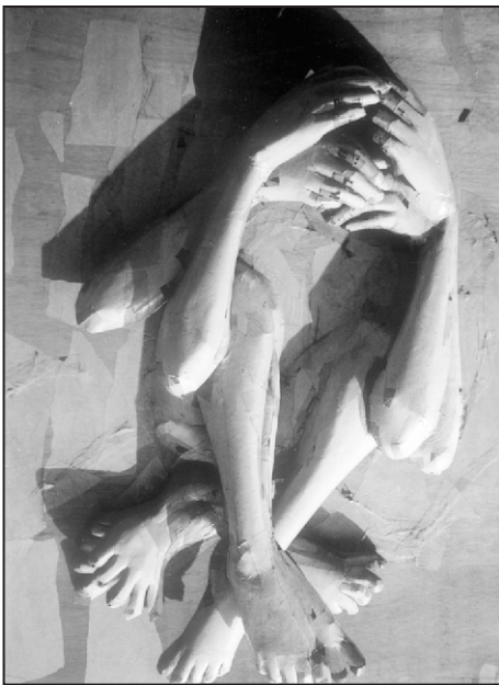
Untitled-II, paper carving