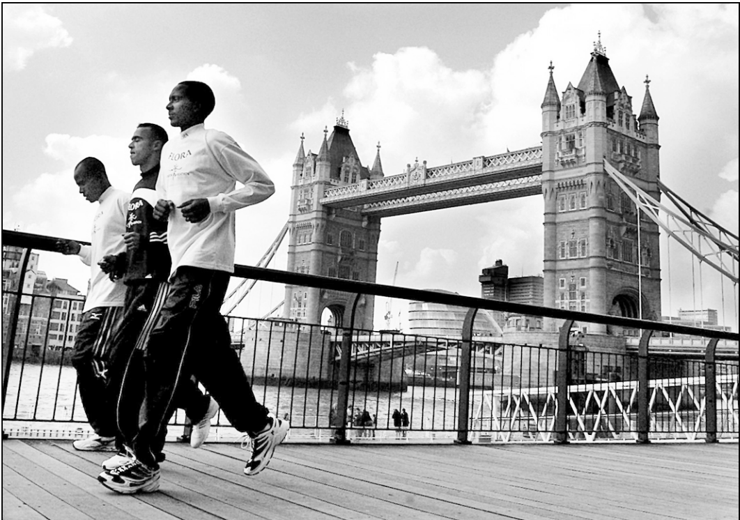
Olympic champion and 2003 London Marathon winner Gezahegne Abera of Ethiopia ( L ), world marathon champion Jaouad Gharib of Morocco (C), and the second fastest Marathon runner of all-time Sammy Korir jog near Tower Bridge on April 14. The London Marathon takes place on Sunday.