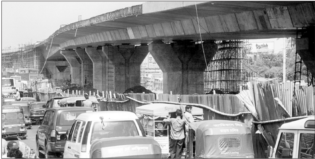
SYED ZAKIR HOSSAIN

railings were yet to be built. Work began on December 6, 2001.