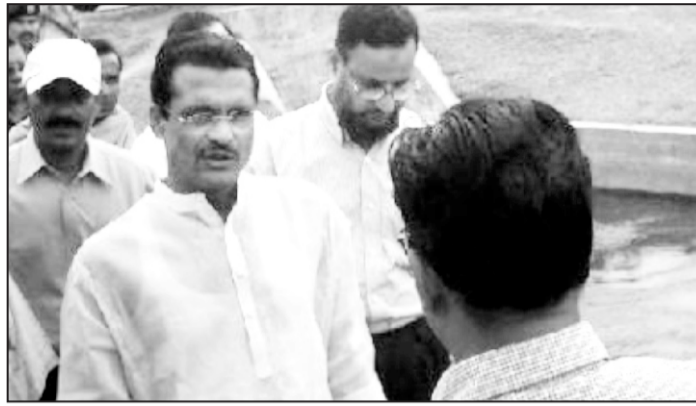
State Minister for Water Resources Advocate Goutam Chakraborty during a visit to some areas under the Teesta Irrigation Project (Phase -1) in Dimla prior to his meeting with farmers on Saturday.

said the first phase of the project has been a grand success in providing irrigation facilities. Work on the second phase of the Teesta Irrigation Project would be started this year, the state minister said. He said the second phase, when implemented, would provide irrigation facilities to 5.40 lakh hectares of land in 33 upazilas of Nilphamari, Rangpur, Dinajpur, Gaibandha, Joypurhad and Bagra district. The project will cost about 1,200 crore taka, he said. Prior to the meeting, the state minister visited different areas in Dimla under the first phase of the project.