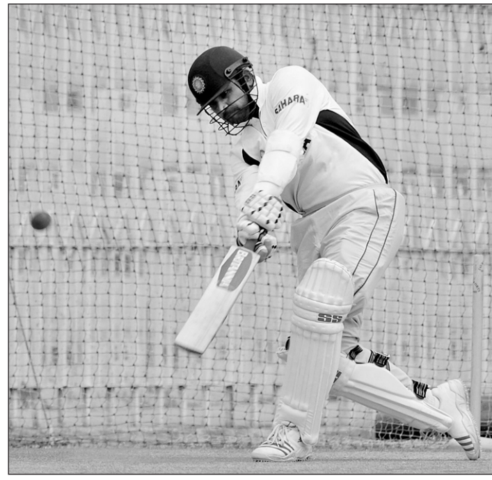
India opener Virender Sehwag bats in the nets during training session at the Pindi Cricket Stadium yesterday.