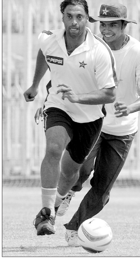
BECAME BECKHAM? Pakistan fast bowler Shoab Akhtar is under pressure from leg-spinner Danish Kaneria while playing football during a practice session at the Pindi Cricket Stadium yesterday.

been together, including a 160 at Multan. If Chopra is omitted, either Yuvraj or young wicketkeeper Parthiv Patel will open the batting so that the seasoned middle-order of Rahul Dravid, Sachin Tendulkar, Venkatesh Laxman and Ganguly remains undisturbed.