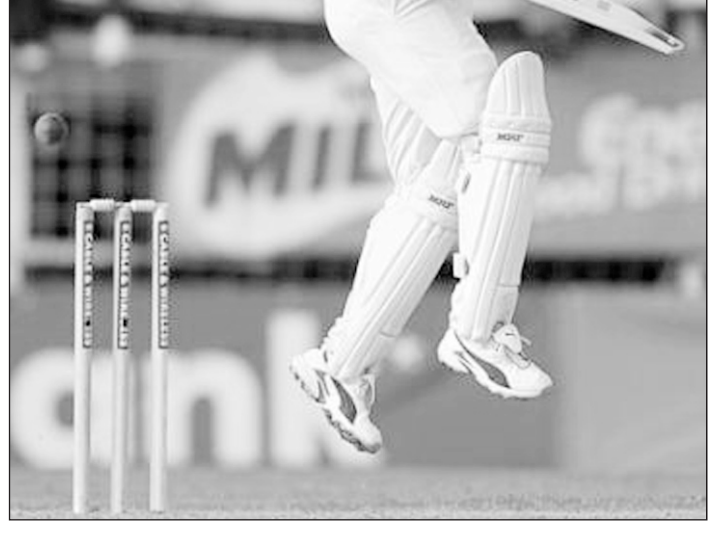
West Indies captain Brian Lara leaps as he plays the ball on the on-side during the first day's play of the fourth and final Test against England at the Antigua Recreation Ground on Saturday.

Brian Lara, using the easy nature of the Antigua Recreation Ground pitch, was within sight of his 25th Test hundred as West Indies enjoyed their best day with the bat against England on the rain-affected opening day of the fourth and final Test. Looking like a true world class act for the first time in the series, the West Indies captain was undefeated on 86 to lift West Indies to 208 for two when bad light stopped play on Saturday. West Indies vice-captain Ramnaresh Sarwan was not out on 41 and has shared an unbroken stand of 110 with Lara for the third wicket to add substance and stability to the wobbly batting. With England's bowlers emasculated by the friendly nature of the pitch and not benefiting from the same appreciable bounce and movement they gained in the three previous Tests at Kingston, Port of Spain and Bridgetown, West Indies bullied their way to a confident position at the close. Chris Gayle had earlier set the tempo for West Indies with a pulsating 69 that included a dozen boundaries from 80 balls in two hours. "The wicket here is really flat so