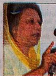
Prime Minister Khaleda Zia addresses a rally on the Physical Training College ground in Mohammadpur yesterday.