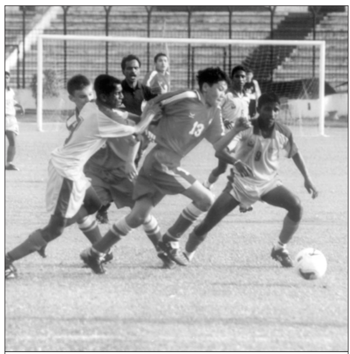
Action from yesterday's AFC U-14 Football Festival encounter between Sri Lanka and Kyrgyzstan at the Bangabandhu National Stadium.

Bangladesh suffered a 7-0 thrashing against Iran in the last match of the Asian Football Confederation (AFC) U-14 Football Festival at the Bangabandhu National Stadium yesterday. However, the hosts are poised to receive the fair play trophy with a comfortable lead of 137.14 points against second placed Sri Lanka's 66.28 points in the four-nation competition. But the final standings could not be known when this report was being filed at 9pm. Bangladesh trailed 3-0 at half-time. The home team's defenders were found wanting against the physically superior Iranian forwards. Earlier, Kyrgyzstan beat Sri Lanka 2-0.