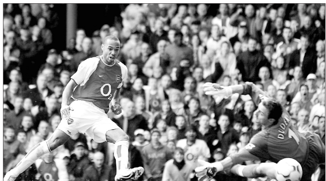
HAIL HENRY! Arsenal ace Thierry Henry (L) puts the ball beyond Liverpool goalkeeper Jerzy Dudek for his second goal at Highbury yesterday.

immaculate and Gerrard's powerful header back across goal was nudged over the line by Hyypia. With Liverpool using Owen as a lone striker in front of a five-man midfield, Arsenal's prospects of getting back into the match did not look good and they were fortunate not to fall further behind. A Kewell shot needed a deflection off Lauren to carry it fractionally wide of Lehmann's left-hand post and Owen will have been frustrated at his failure to exploit John Arne Riise's punt into the box, which caught the Arsenal defence napping for the second time in the match. With only Lehmann to beat, the England striker lifted his shot over SEE PAGE 14 COL 1