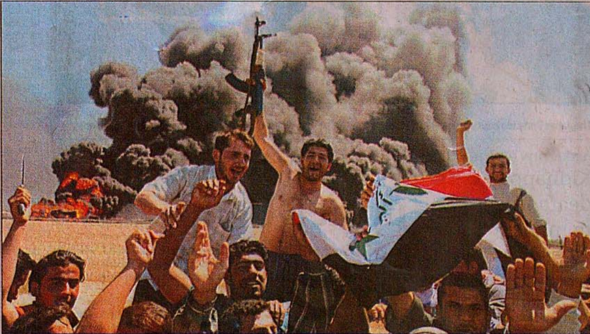
Iraqis, left, shout anti-US slogans at a rally outside Baghdad's Umm Qura Sunni mosque; and Iraqi insurgents, right, wave their national flag as they celebrate in front of a burning US military tanker after attacking it with rocket-propelled grenades in Abu Gharib, 15km west of the Iraqi capital, yesterday.