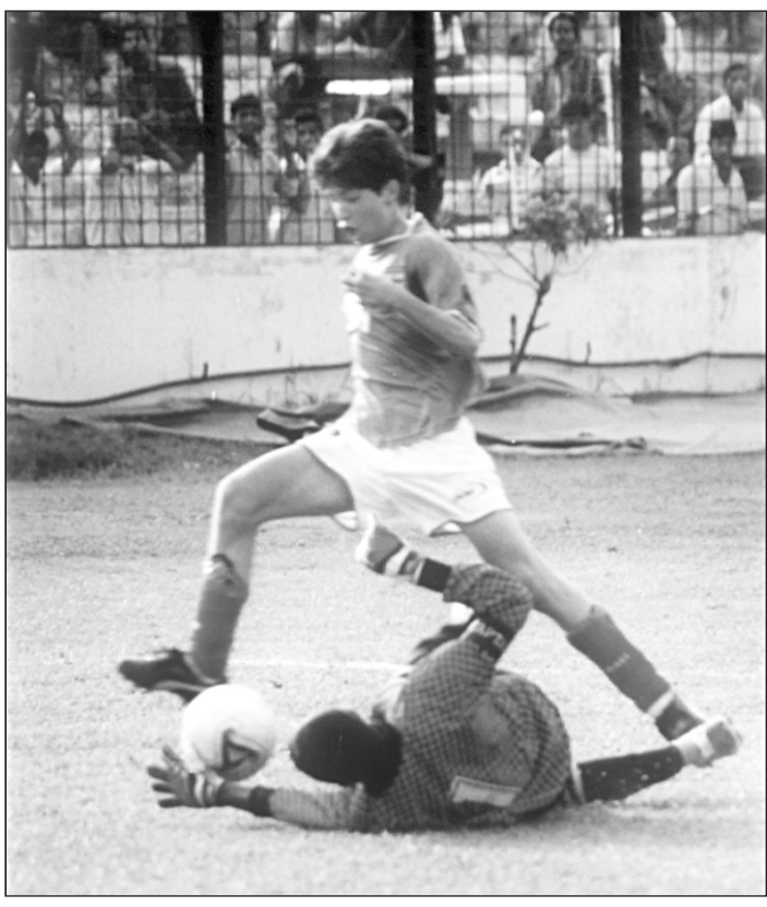
AN IRANIAN PLAYER tries to go round the Sri Lanka custodian during their AFC U-14 Football Festival encounter at the Bangabandhu National Stadium yesterday.

SQUAD Michael Papps, Mark Richardson, Stephen Fleming (captain), Scott Styris, Craig McMillan, Nathan Astle, Chris Cairns, Jacob Oram, Brendon McCullum, Daniel Vettori, Daryl Tuffey, Chris Martin, Kyle Mills, Shane Bond.