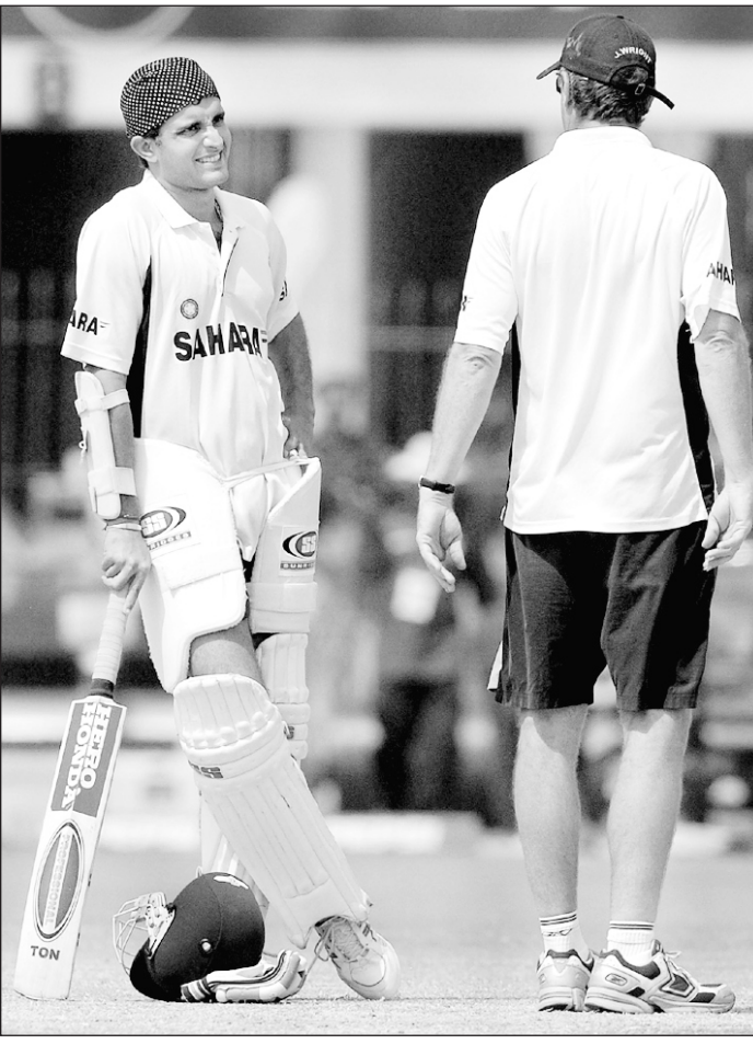
GOOD TO SEE YOU BACK: India captain Sourav Ganguly (L) listens to coach John Wright during a practice session at the Gaddafi Stadium in Lahore after the second Test ended yesterday.